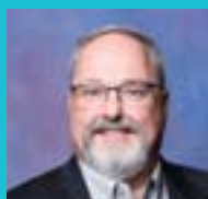
David Tatum Communications