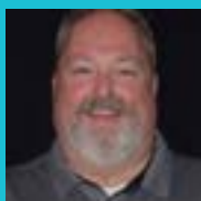
David Tatum Communications