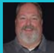
David Tatum Communications