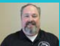
David Tatum Communications