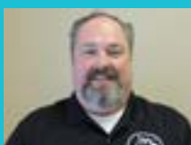
David Tatum Communications