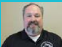
David Tatum Communications