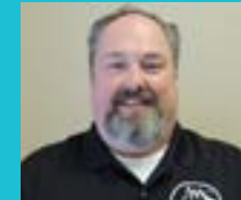
David Tatum Communications