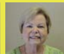
Lequjeta Endel Sop 2 Host