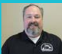
David Tatum Communications