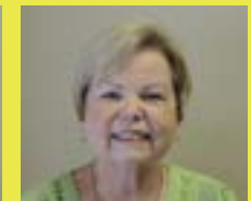
Lequieta Endel Sop 2 Host